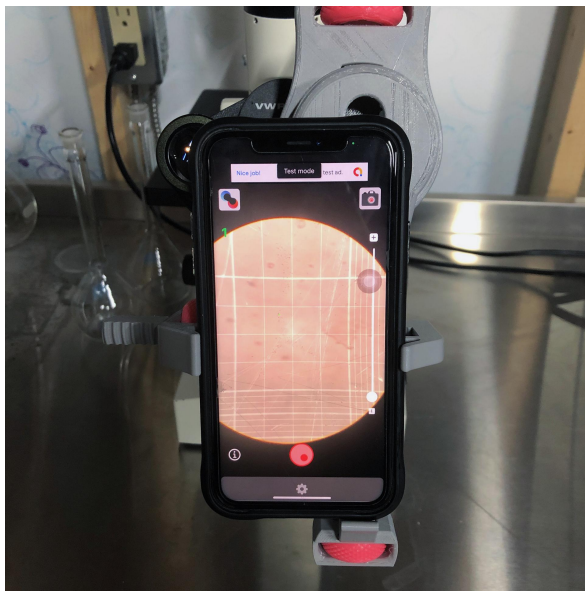
Santiago's app in action counting cells!

For over a year now, New Harvest seed grantee Santiago Campuzano has been working on an app to automate a tedious step in cultured meat research: counting cells.